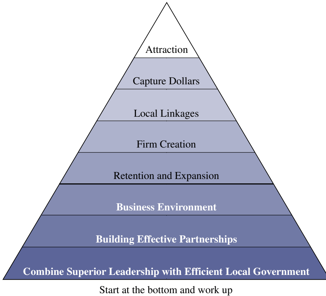
Figure 3. The Economic Development Pyramid

shoppers, retirees, tourists and other travelers. To attract attention the community has to be attractive . In the last 20 years Manhattan has built several industrial parks and upgraded the airport. It has widened the highways coming into town and built new recreational facilities and shopping districts.